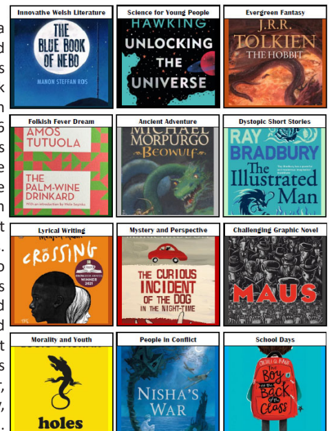
12 Reads for Students at Marling School

This week, students and staff took part in a series of creative activities to celebrate World Book Day. The festivities began with teachers decorating their classroom doors with artwork inspired by a favourite book or author, with displays prepared in time for judging on 6 March. As the week continued, tutor groups worked on the Odd Poetry Competition, where each year group was challenged to produce a unique style of poem based on a set form and theme, using two tutor sessions to craft their entries as they competed for prizes. On Thursday, teachers were encouraged to "go all in" by weaving reading-related tasks into their lessons in whatever way suited their subject, from cold-read challenges and headline rewrites to logic puzzles, script performances, and even drawing activities inspired by descriptive passages. Altogether, the week offered a lively mix of creativity, collaboration, and literary celebration.